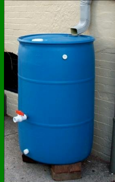
Locally sourced and outfitted Blue 55-gallon capacity; fixed top; re-purposed and food grade barrel; cost $30