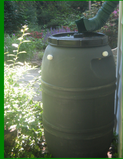
Gray 60-gallon capacity; screw top; re-purposed and food grade barrel; cost $50

Building stronger and healthier communities through environmental projects.